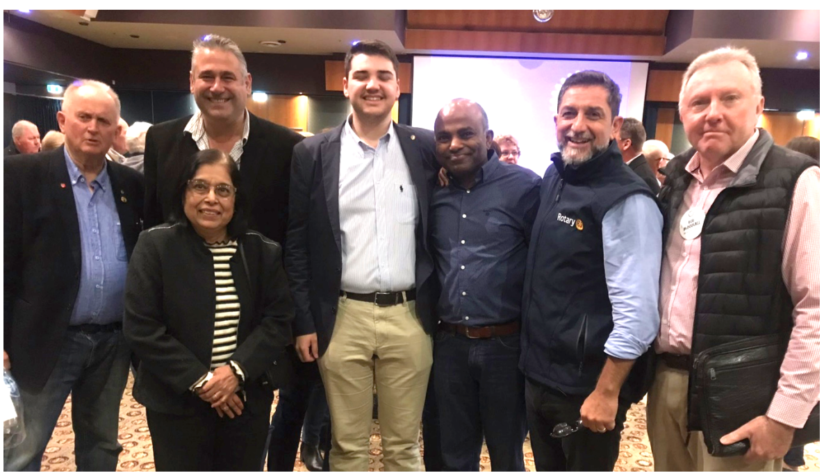
Our 2019/2020 incoming Board