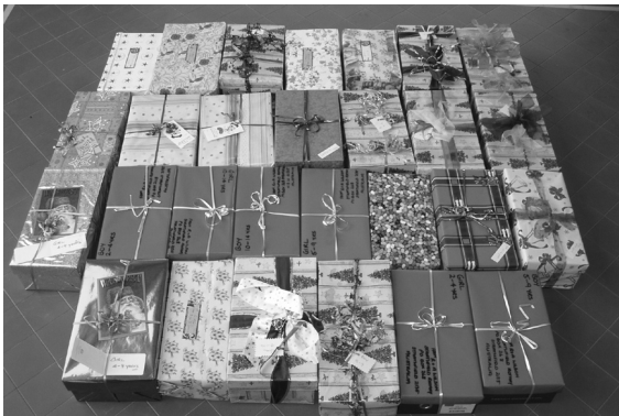
Strathfield Rotary Christmas Shoeboxes for Timor Leste