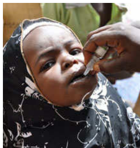
A child receives oral polio vaccine during a National Immunization Day in Nigeria. The perseverance that has reduced the incidence of polio in Nigeria by 97 percent is also being applied to the current outbreak in the Congo Republic.

"Our experience shows that where polio transmission has been stopped before, it can be stopped again," Scott says. "A fast, large-scale, high-quality immunization response using the new tools at hand, along with strong surveillance, is absolutely critical."