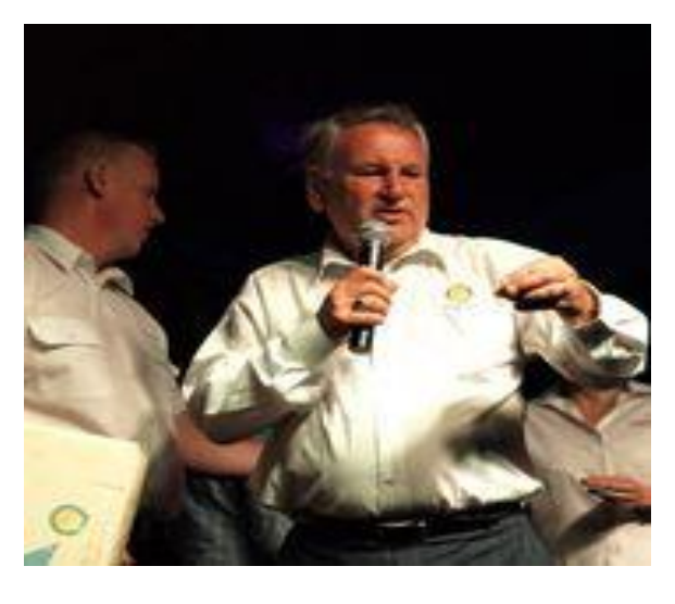
The financial result on the night allowed us to make a $3,000 donation to the Salvation Army.

Who kindly donated all the sausages and onions for our BBQ at Carols in the Park, a value of approximatley $800.