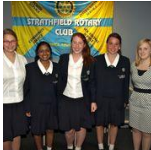
Meriden School Debating Team