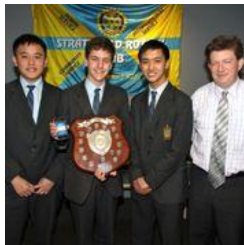
St. Patrick's College Debating Team