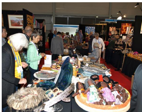
Indigenous Craft for Sale