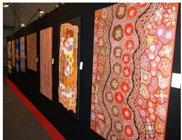
Indigenous Art Display