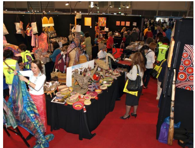
Indigenous Craft for Sale

Congratulations to all members involved in making the Indigenous Art and Craft exhibit in the House of Friendship such a success