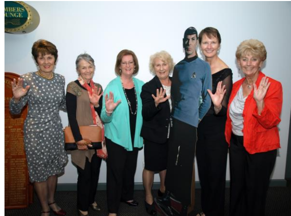
All the Ladies.....