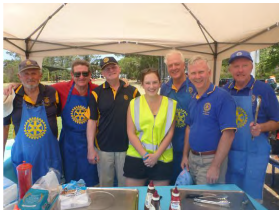
Team members, happy with their "supervisor"

Last Sunday , Beyond Blue held a soccer tournament at Mason Park Homebush and our Club provided BBQ facilities for them.