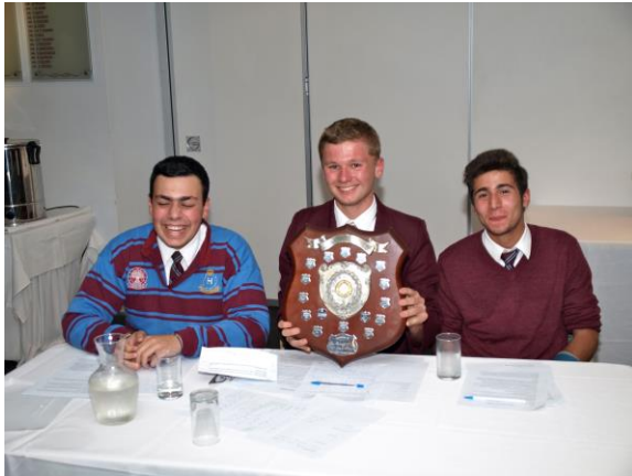
Homebush Boys High School was awarded the "Lew Wilson Shield".