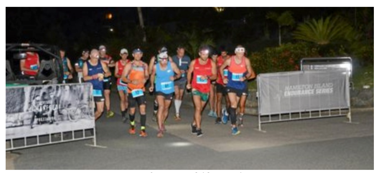
So far, so good (the start)