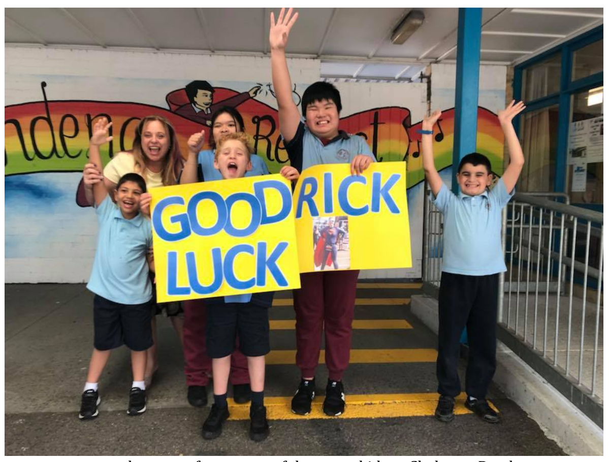
...and support from some of the super kids at Chalmers Road