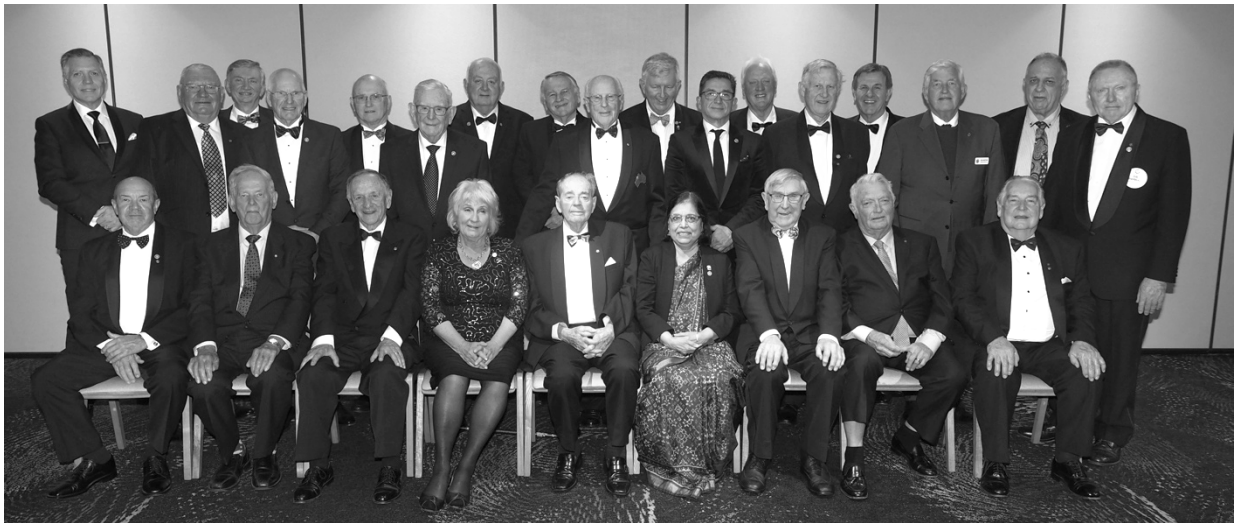
Ex-Presidents of the Rotary Club of Strathfield (plus the current President) in attendance at the 50 th Anniversary Celebration

Events like this encapsulates what Rotary is all about – a celebration of fellowship within the Club and an acknowledgement of the service we give to our community and to the world to help make lives better .