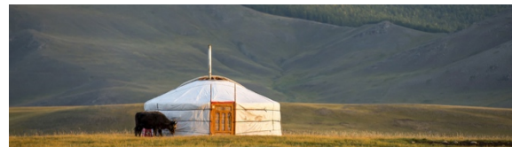
Extensive treeless grass covered “Steppe”

Nomadic Mongolians live on the steppe. Because of the severe climate, they must move at least twice a year taking their animals and houses with them. The portable house called Ger are a round semi-permanent yurt which can be picked up or reconstructed in less than 2 hours. Ethnically, Mongolia is 96% Mongol and 4% Kazak. 53% of Mongolians are Buddhist. As is common in many ex-communist countries, atheism the next most common belief.