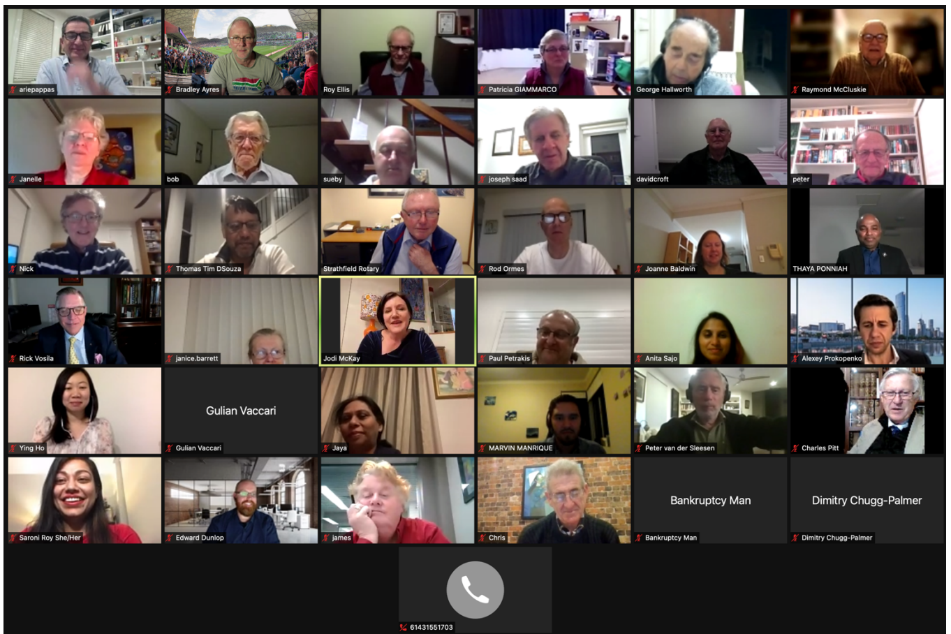
Another great Zoom rollup