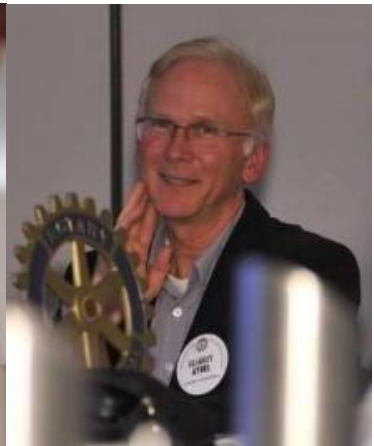
From whisperings, to concentration, to little asides, to happy Rotarians