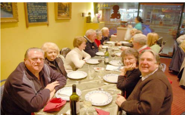
Evening at the Budda Raska