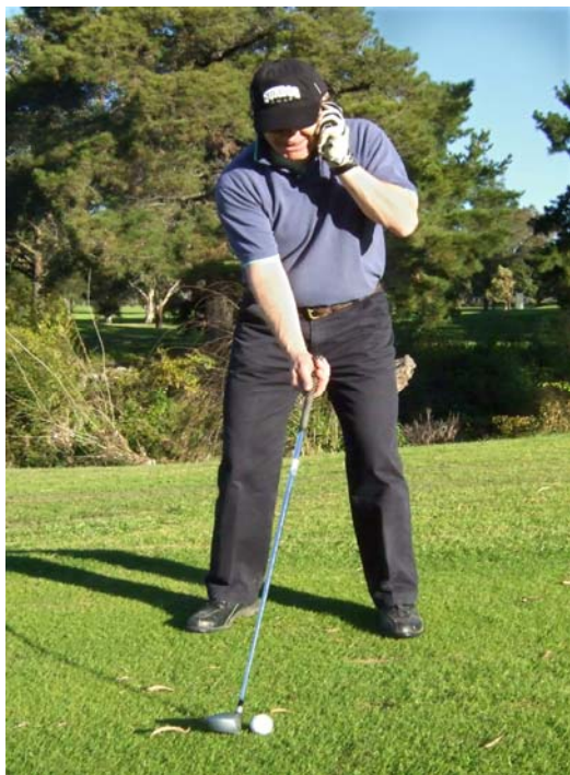
Golfer playing to his Handicap