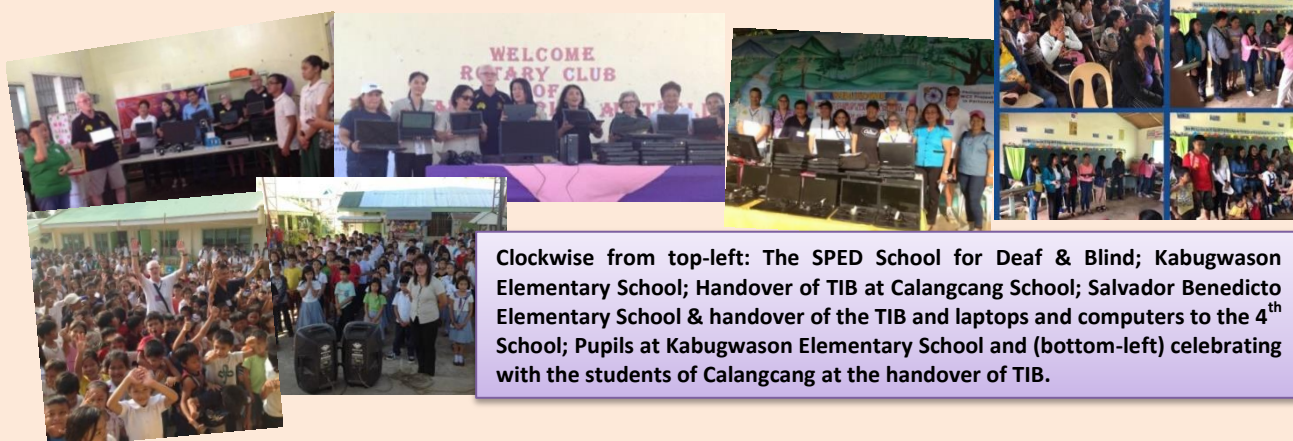
Clockwise from top-left: The SPED School for Deaf & Blind; Kabugwason Elementary School; Handover of TIB at Calangcang School; Salvador Benedicto Elementary School & handover of the TIB and laptops and computers to the 4 th School; Pupils at Kabugwason Elementary School and (bottom-left) celebrating with the students of Calangcang at the handover of TIB.

The team also distributed lap top computers, clothing and teaching resources to several schools, and donated medical equipment was presented to local health services.